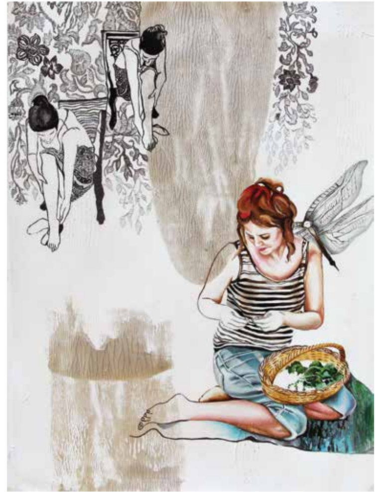
Memories Oil and acrylic on paper 16" x 12" • 2022