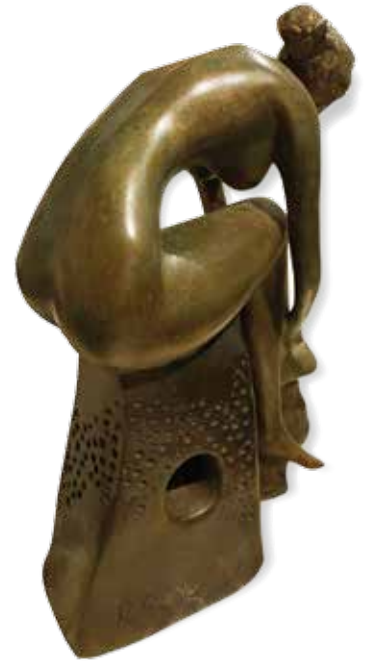
Soulsense Bronze • 17" x 11" x 13" • 2022