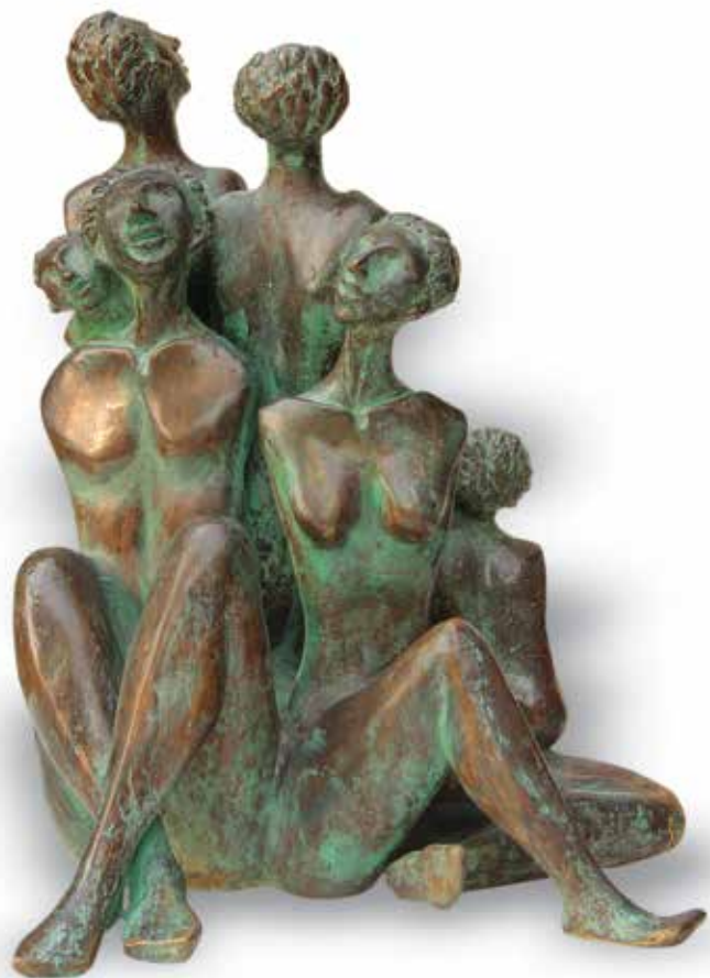
The Bonding | Bronze | 15" x 16" x 16" | 2013