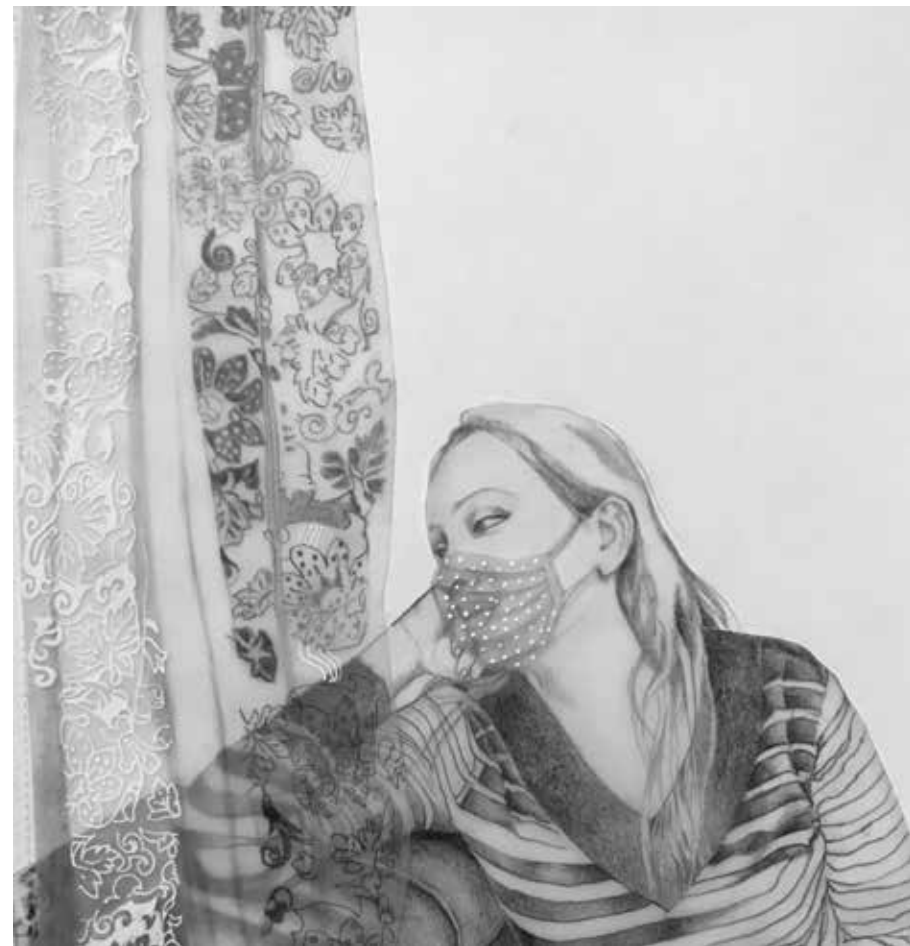
Mind is Free-2 • Drawing on paper • 7.5" x 7" • 2020