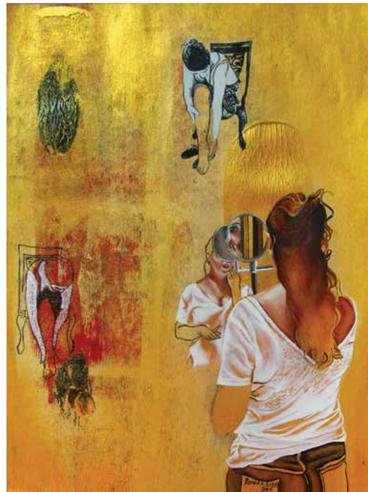
Seeing Beyond-2 Oil and acrylic on paper 16" x 12" • 2021