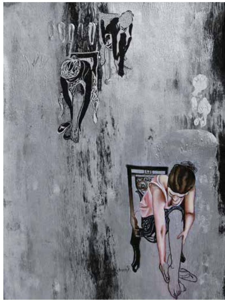
Soul Essence Oil and acrylic on paper 16" x 12" • 2021