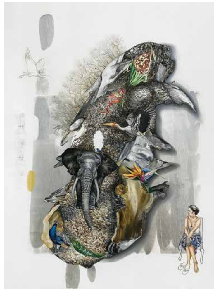
The Living Ark-5 Oil and acrylic on canvas 48" x 36" • 2020