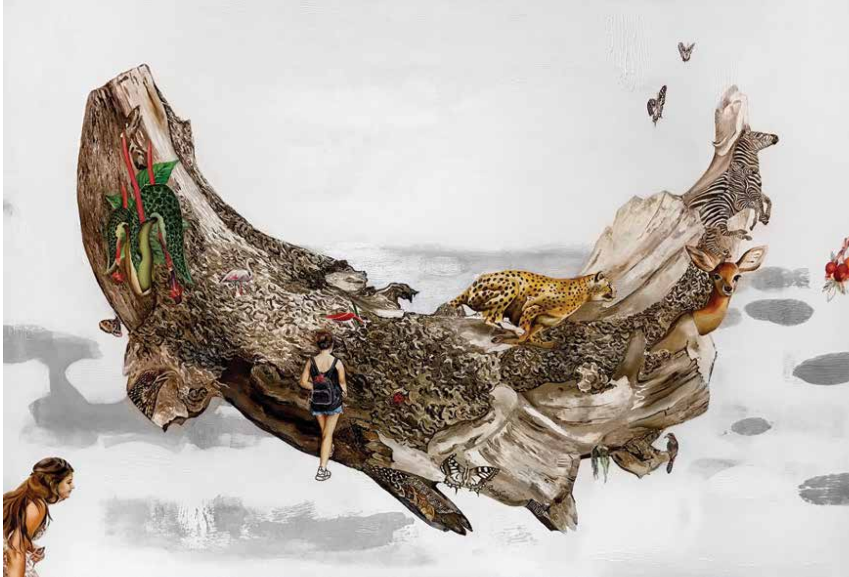
The Living Ark-3 Oil and acrylic on canvas 36" x 48" • 2019