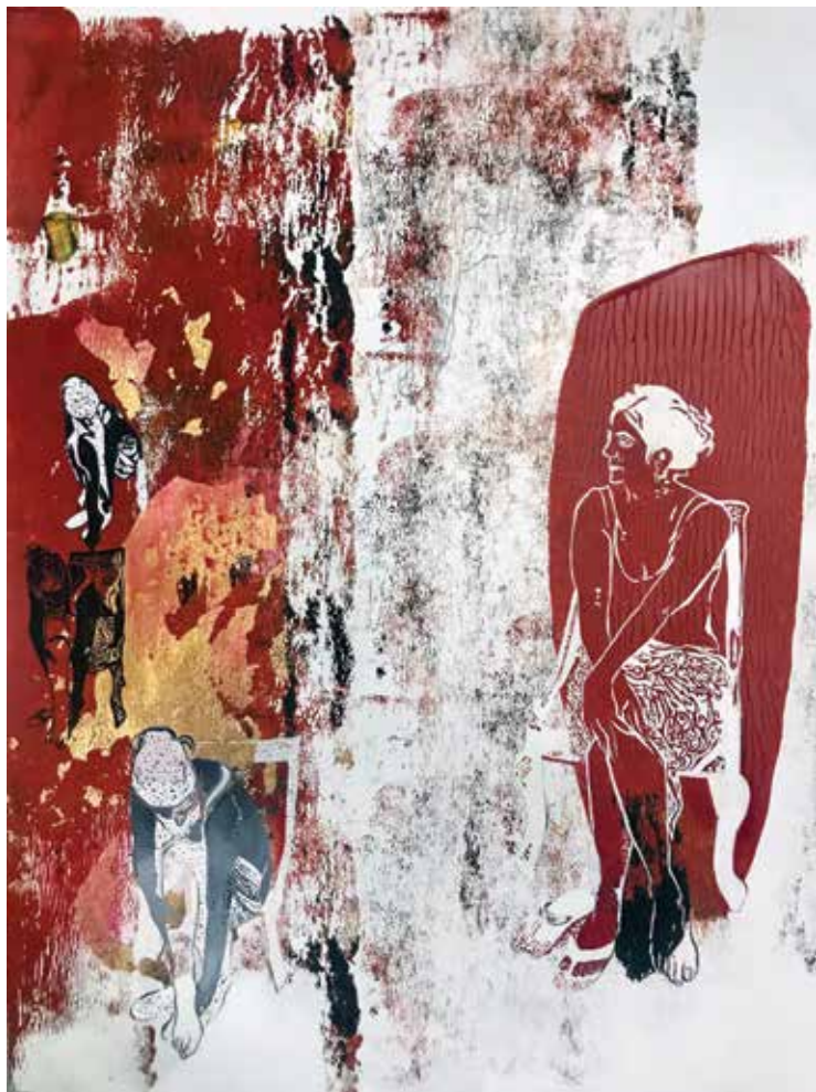
Reflections-1 Oil and acrylic on paper 16" x 12" • 2021