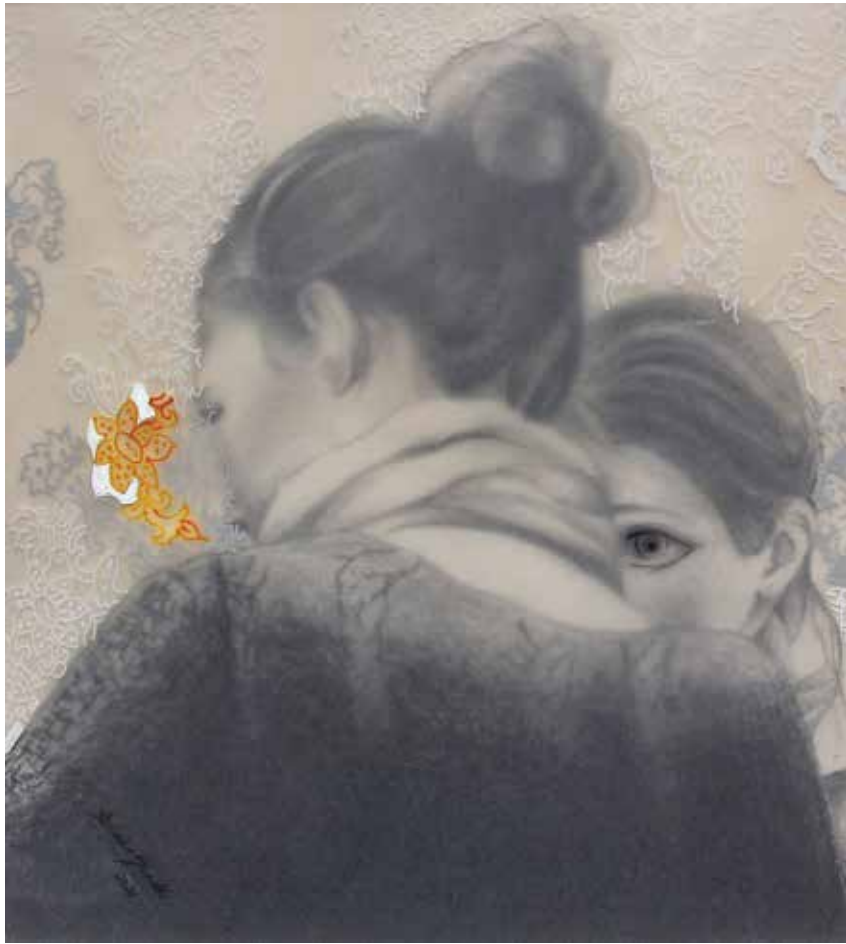
Seeing Through My Vision • Drawing on paper • 7.5" x 7" • 2020