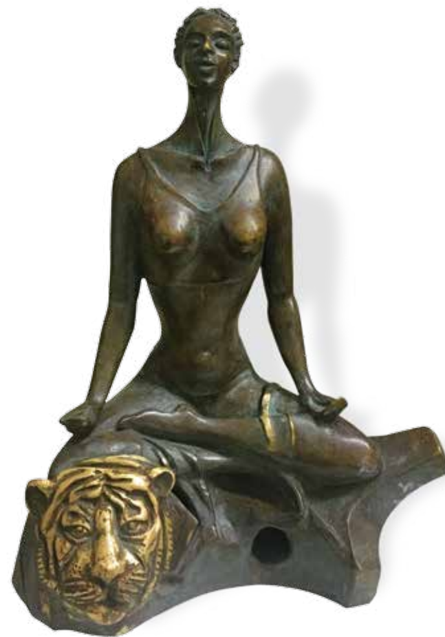
My Inner Search | Bronze | 13" x 10" x 17" | 2018