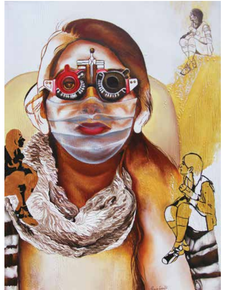
Re Vision-3 Oil and acrylic on paper 16" x 12" • 2021