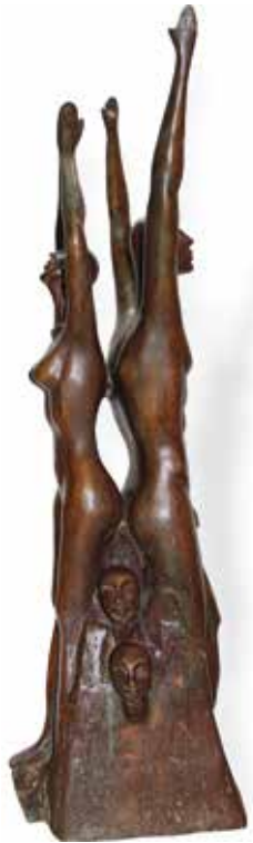
Thanking God | Bronze | 27.5" x 10" x 6" | 2015