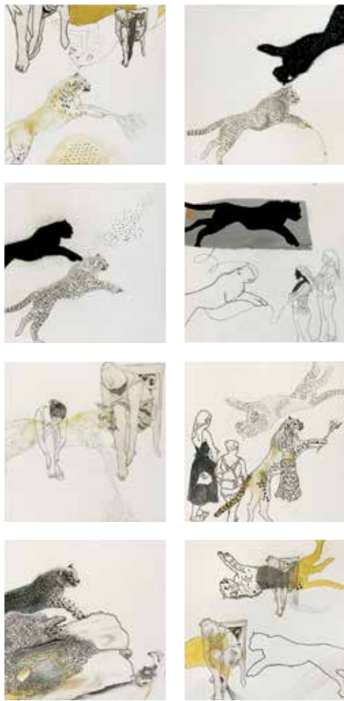
The Power Play Drawing on paper 7.5" x 7" each • 2020