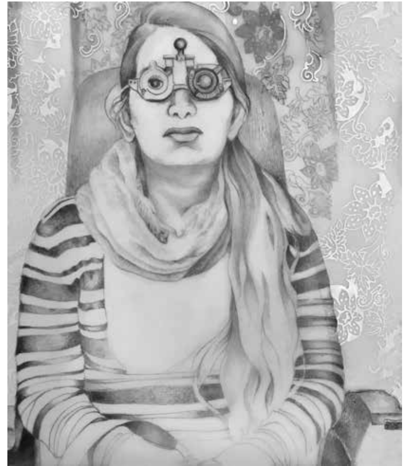
Mind is Free-1 • Drawing on paper • 7.5" x 7" • 2020