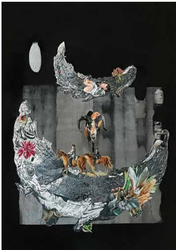
The Living Ark-4 Oil and acrylic on canvas 48" x 36" • 2020