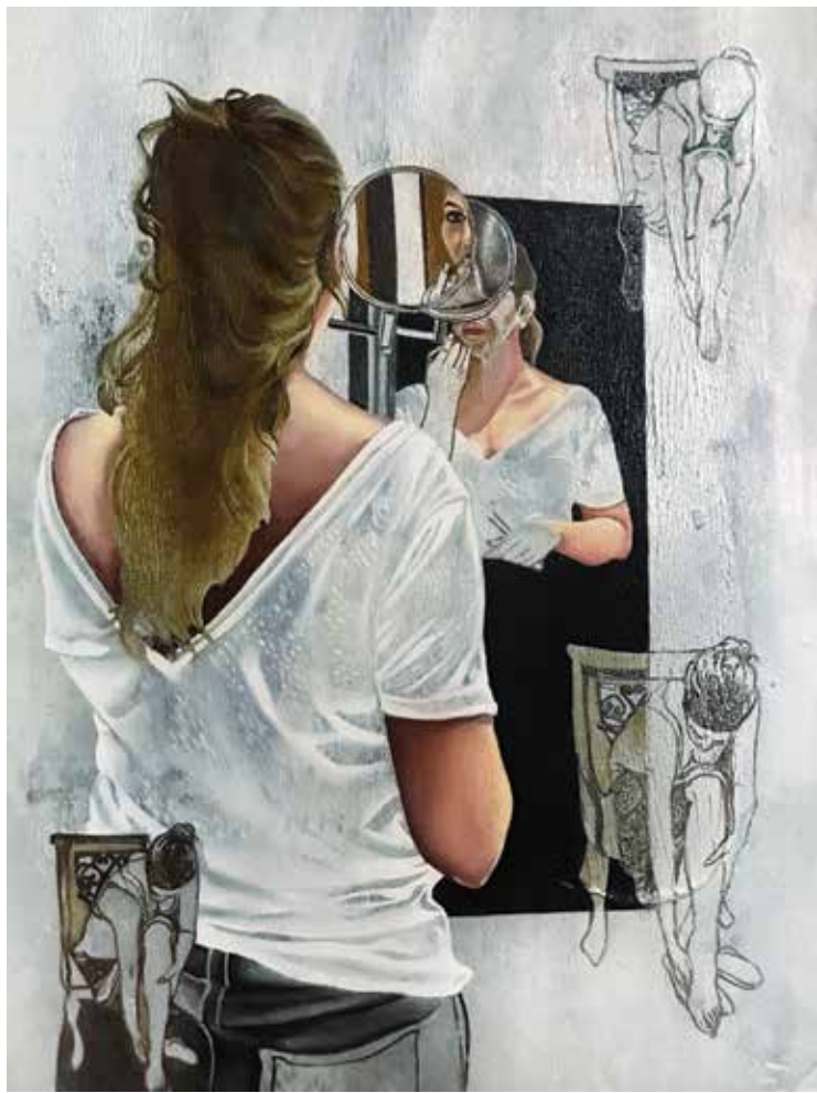
Seeing Beyond-3 Oil and acrylic on paper 16" x 12" • 2021