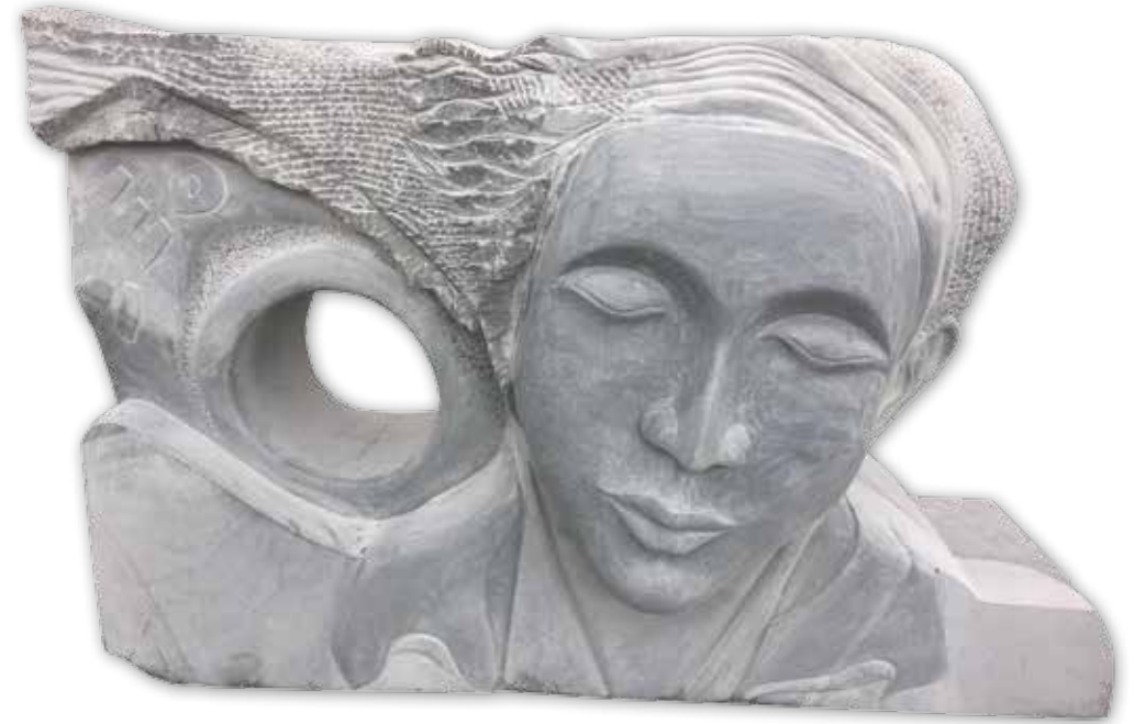
Esoteric-5 Sculpture in granite stone 48" x 60" x 36" • 2019

Installed at Mansa Devi Complex, Panchkula