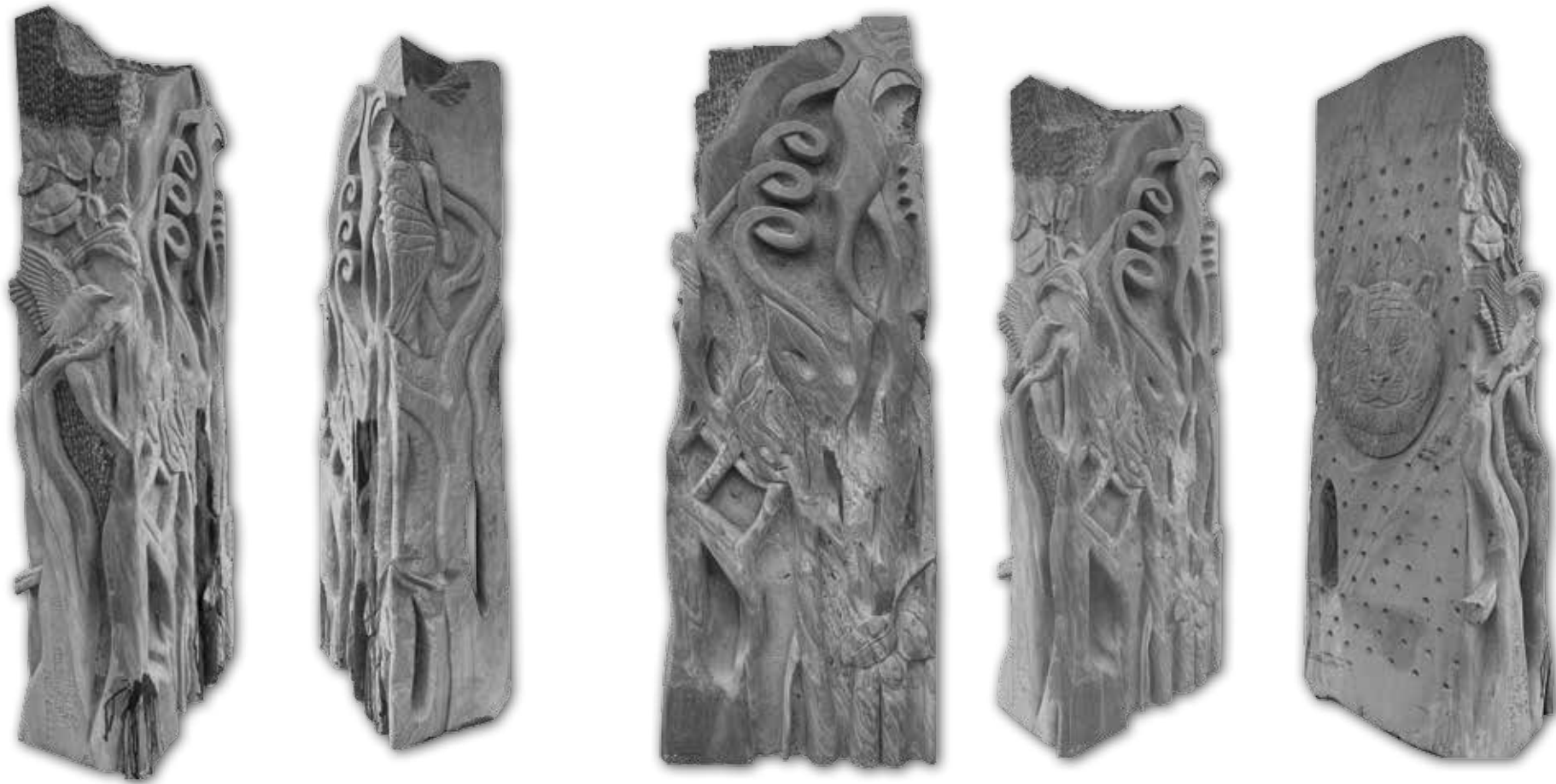
The Living Ark Stone Granite 108" x 24" x 36" • 2022

Installed at Haryana Vidyut Prasasan Nigam Premises