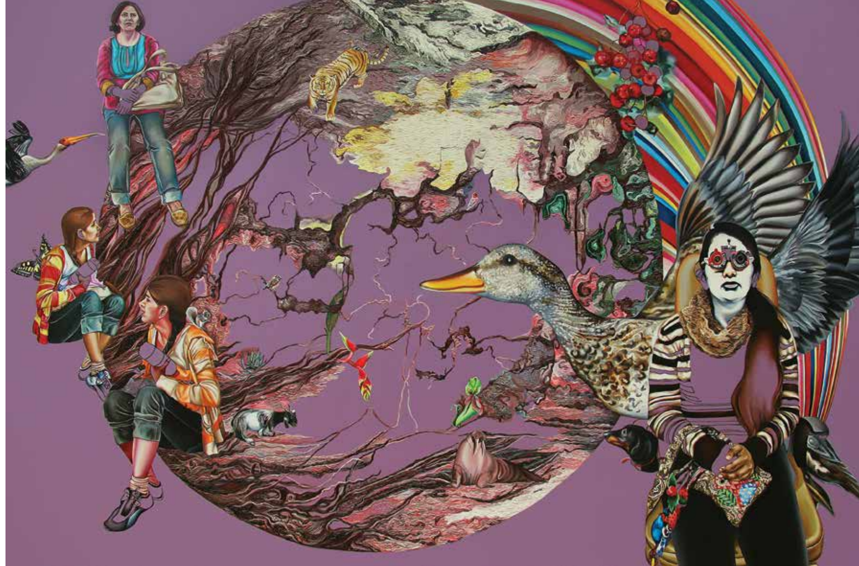
Journey through Nature Oil and acrylic on canvas 48" x 72" • 2021