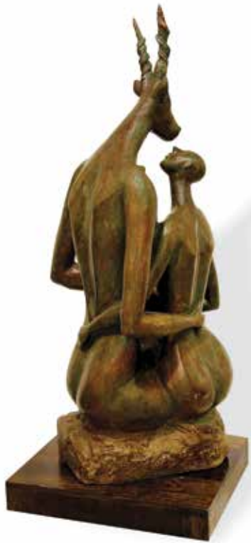
Ecstasy 1 Bronze • 30" x 15" x 13" • 2019