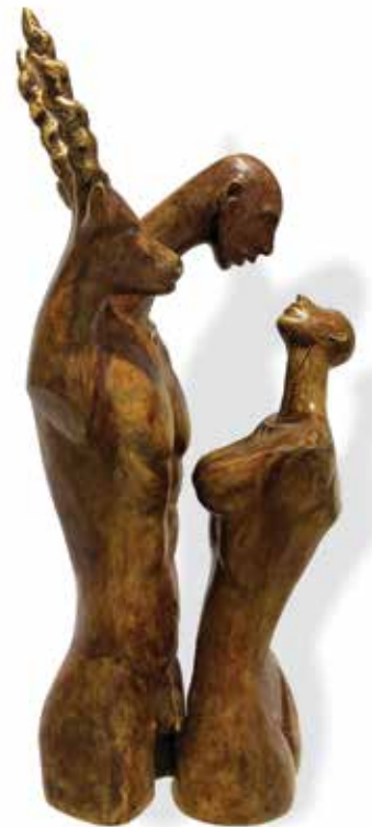
Ecstasy 2 Bronze • 23" x 17" x 15" • 2019