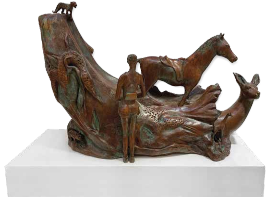
The Living Ark • Bronze • 29" x 18" x 11" • 2020