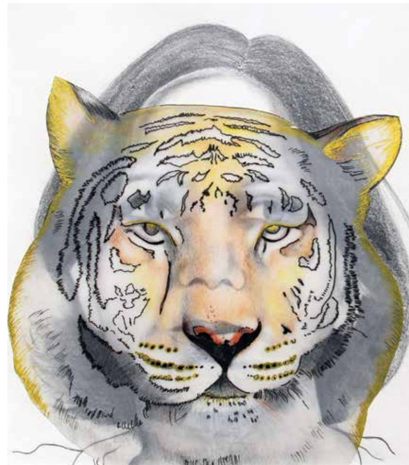
The Innerself • Drawing on paper • 7.5" x 7" • 2020