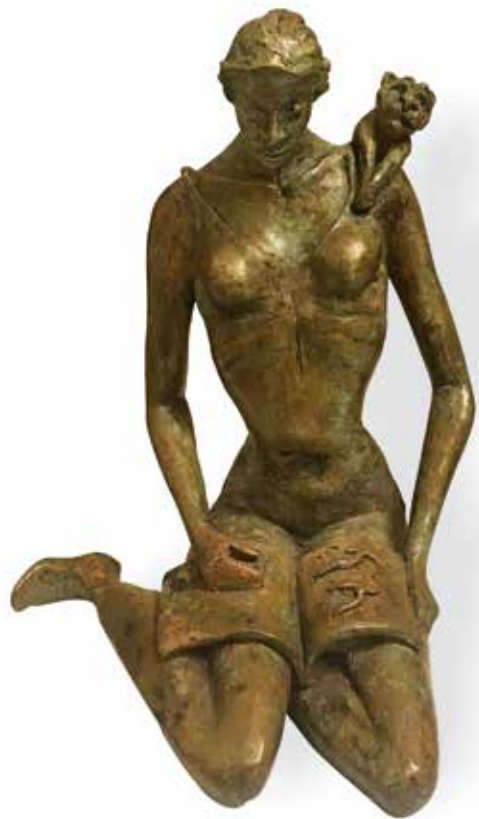
The Power of Thoughts | Bronze | 12.5" x 9.5" x 10" | 2018