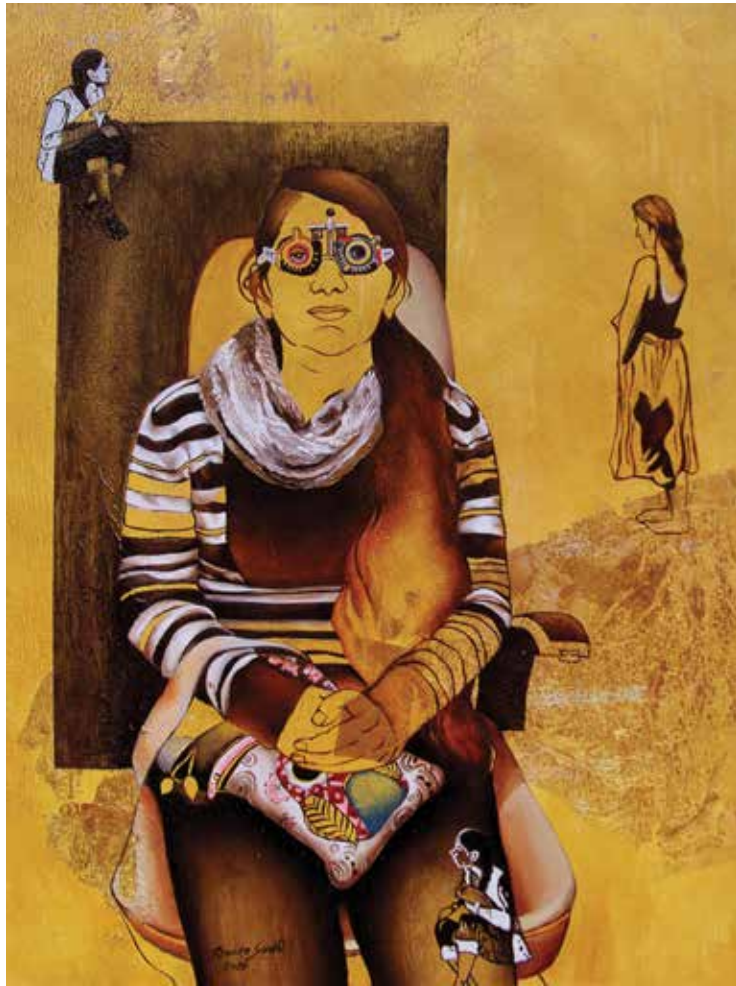
Re Vision-2 Oil and acrylic on paper 16" x 12" • 2021