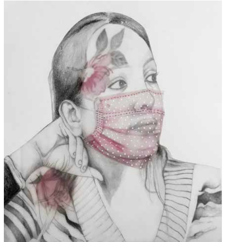
Thoughtful • Drawing on paper • 7.5" x 7" • 2020