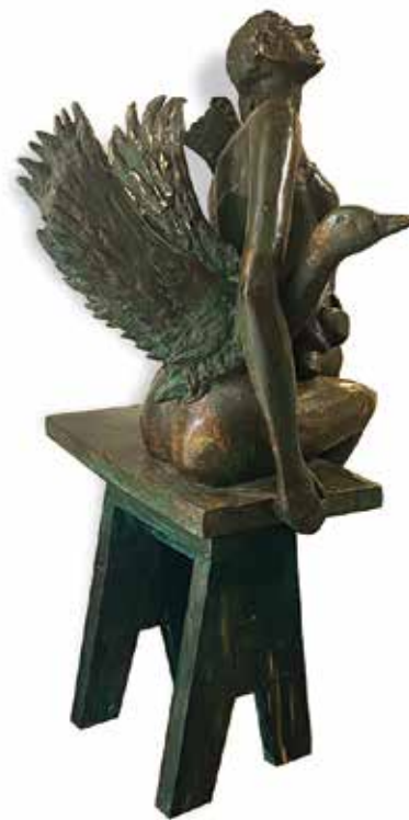
If I had Wings Bronze 21" x 15" x 15" • 2022