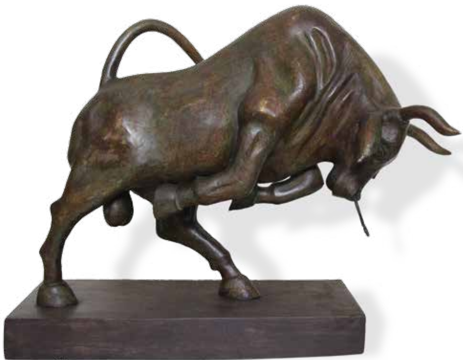
Force | Bronze | 24" x 26" x 10" | 2019