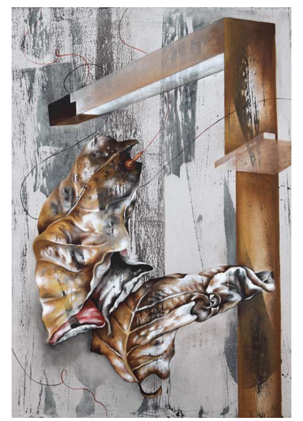
Mystical Resonance | Oil and acrylic on canvas | 24" x 30" | 2009