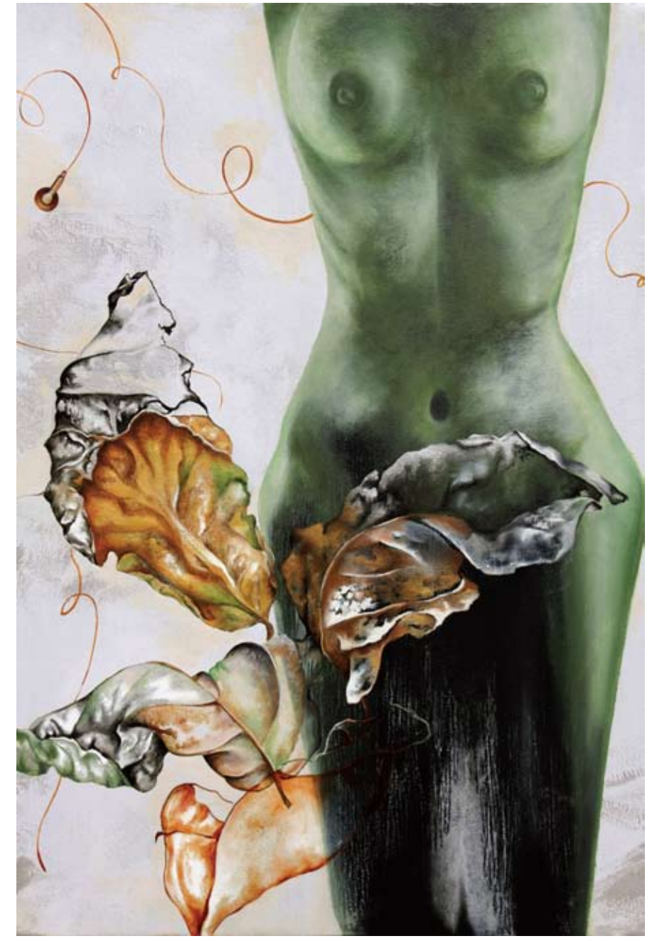
The Eternal Leaf | Oil and acrylic on canvas | 24" x 30" | 2009