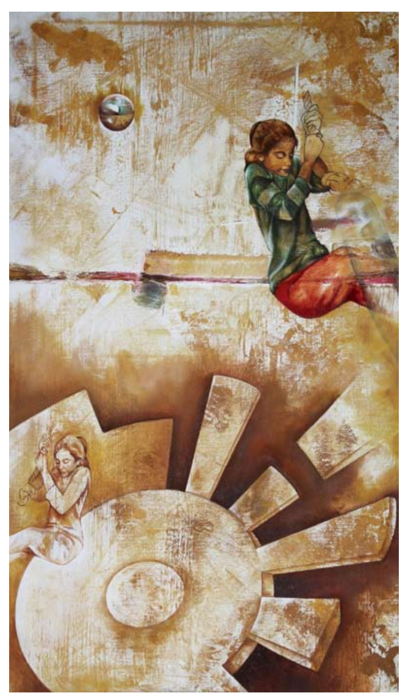
Save me, save the world | Oil and acrylic on canvas | 24" x 40" | 2009